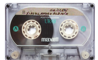
B5 cassetten album (Cassette 1 Side A) Grillen Simulator + Old Mix