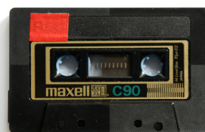
B4 Corpus Christi/N. Deutschland – Life Tapes [Demo] 5.1.83 (Part 2)