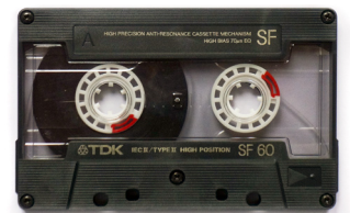
A4 Noise Sampler (Sequenzen, Loops 2) Fades Ready