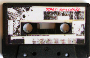
A1 The ShriII: Blech (Cassette 5 Side A Part 5)