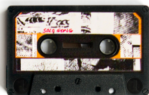
A2 The ShriII: Blech (Cassette 1 Side A Part 3) Solo Gong