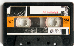
A5 Solo Gong (Side A Part 3)