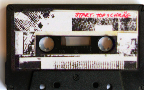
A6 The ShriII: Blech (Cassette 5 Side A Part 4) Start: Top Schräg