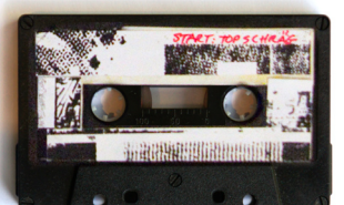
B1 The ShriII: Blech (Cassette 5 Side A Part 8) Start: Top Schräg