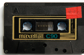
A3 Corpus Christi/N. Deutschland – Life Tapes [Demo] 4.1.83 (Part 7)