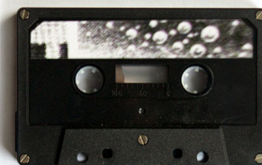
A7 The ShriII: Blech (Cassette 2 Side A)