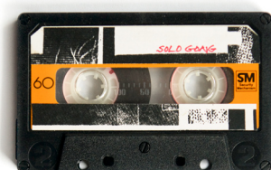
B3 Solo Gong (Side A Part 2)